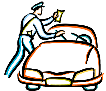
Illegally parked vehicles will be ticketed and towed!

Thank You for your help and cooperation.